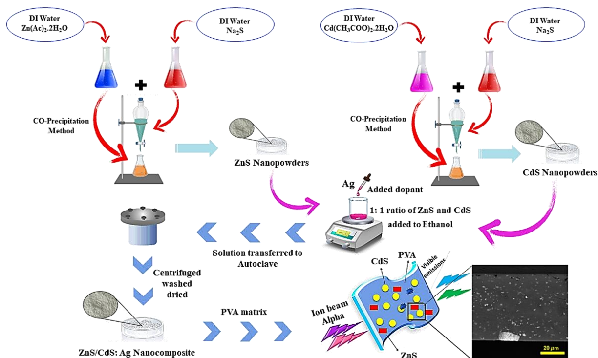
Fig. 1. Experimental process

The crystalline structure and phase of the material were characterized using X-ray diffraction (XRD) on a Bruker D8-Advance system. Field emission scanning electron microscopy (FESEM, TESCAN) was applied to assess the materials' morphology and elemental composition.